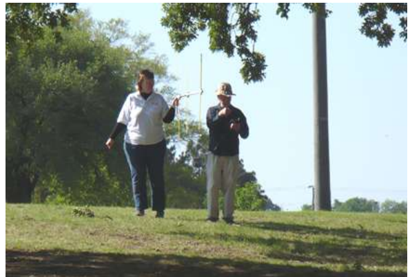
A high vantage point