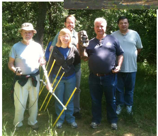
Great fun as usual.