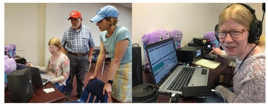
The CW station in operation.