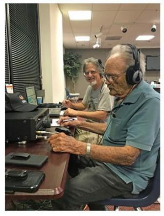
Working the phone station