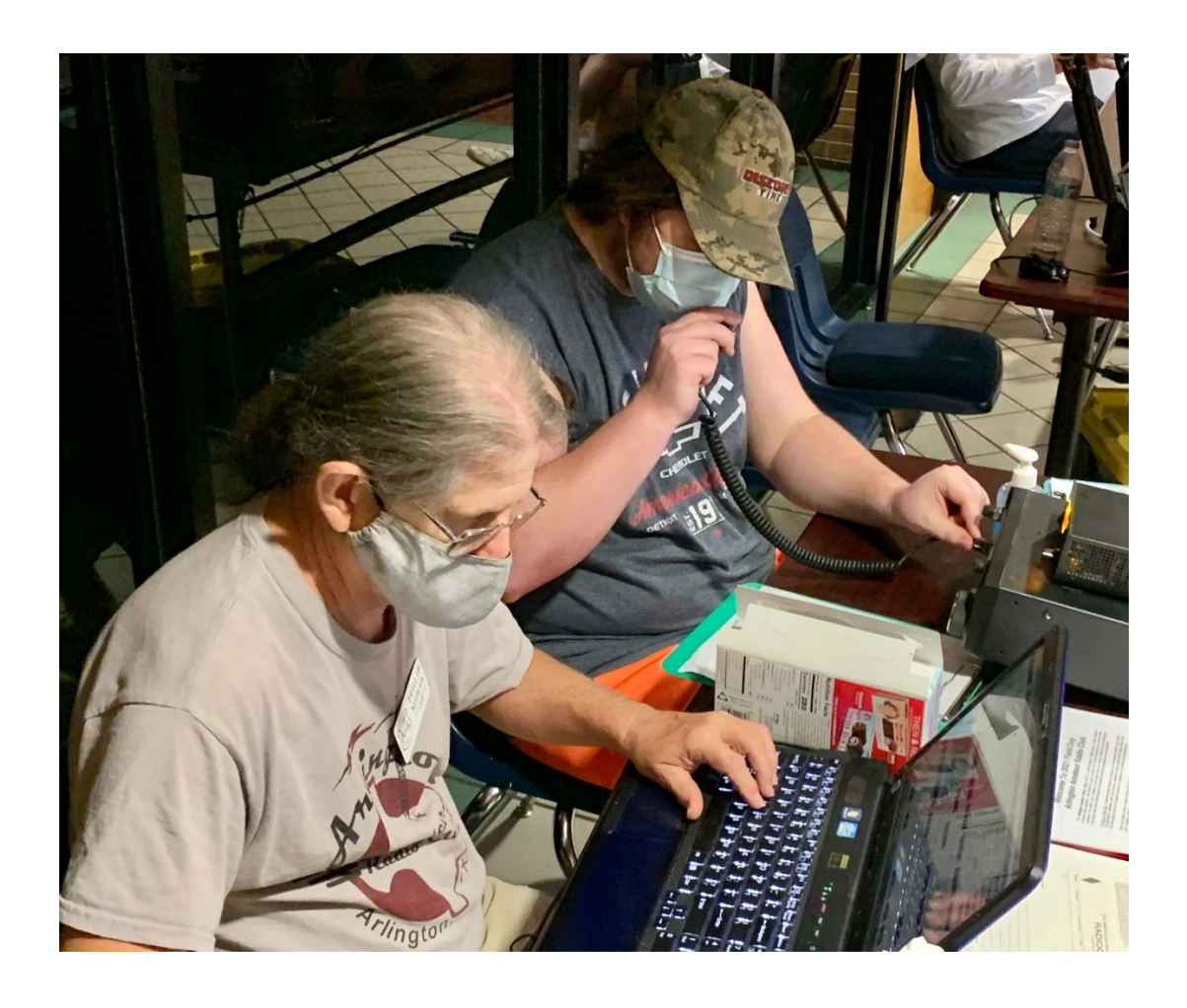
At the GOTA station