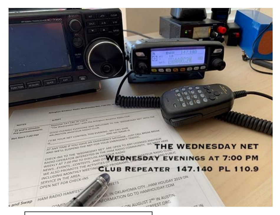
Join us for the Wednesday Net